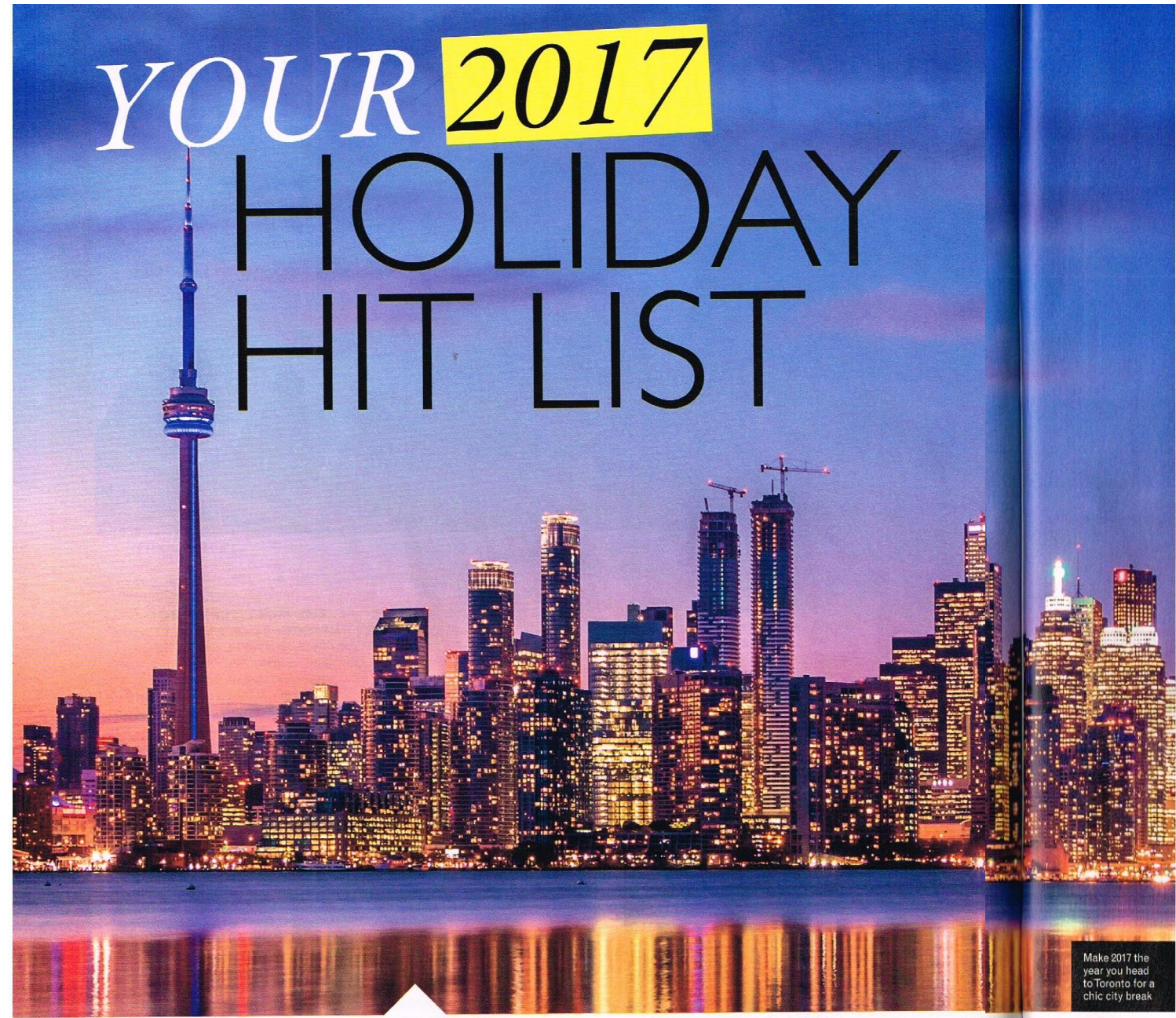
Make 2017 the year you head to Toronto for a chic city break

Another year, another holiday to plan – here are the latest must-visit destinations to tickle your travel fancy