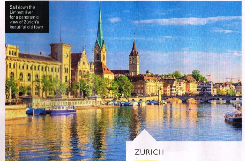
Sail down the Limmat river for a panoramic view of Zürich's beautiful old town