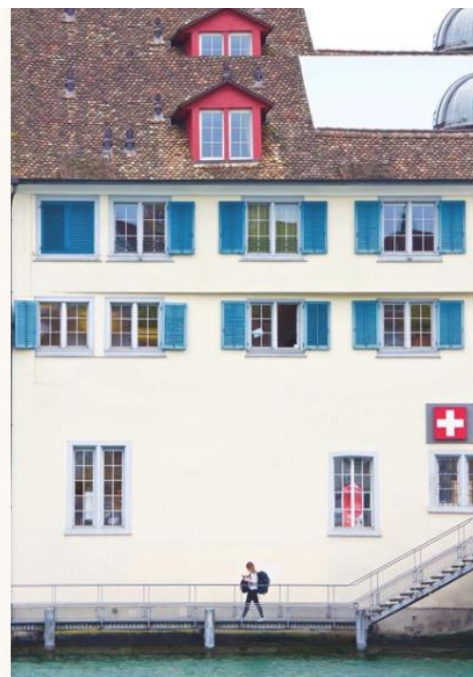
Riverside in Zürich