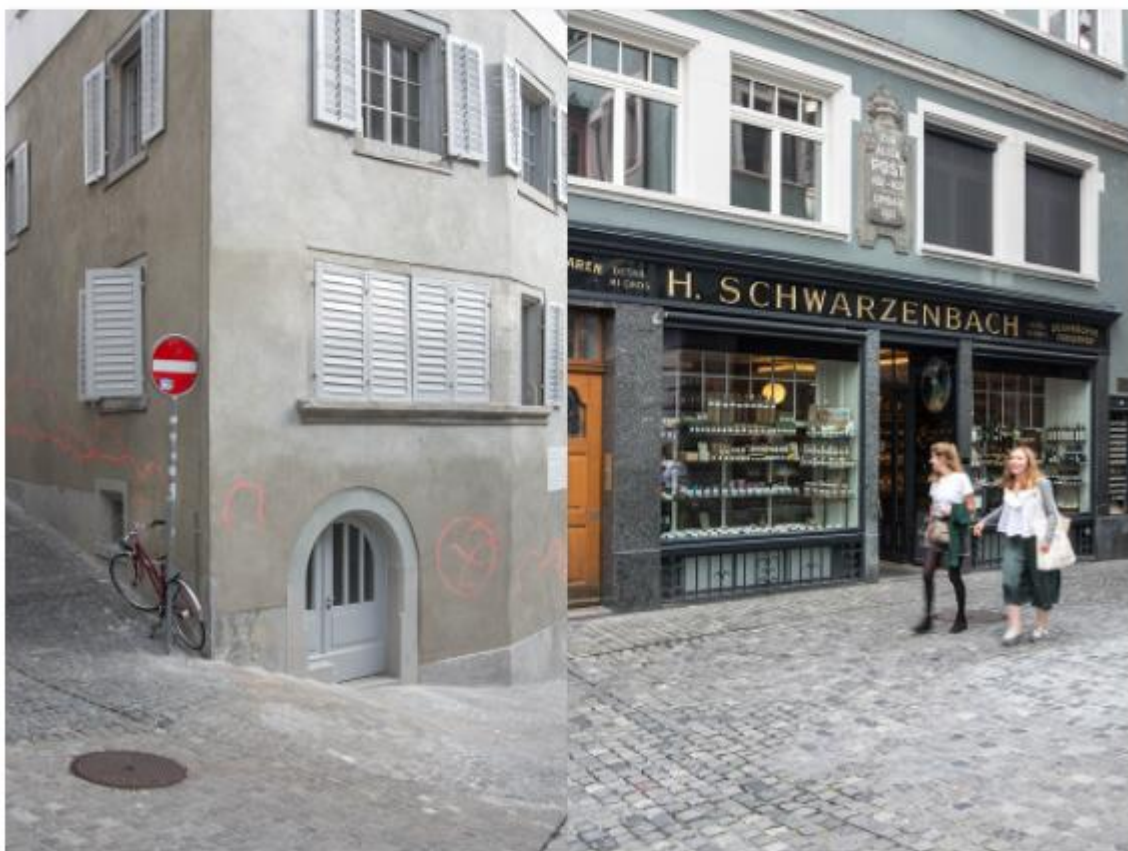
Marktgasse Hotel, Marktgasse 17, 8001 Zürich.